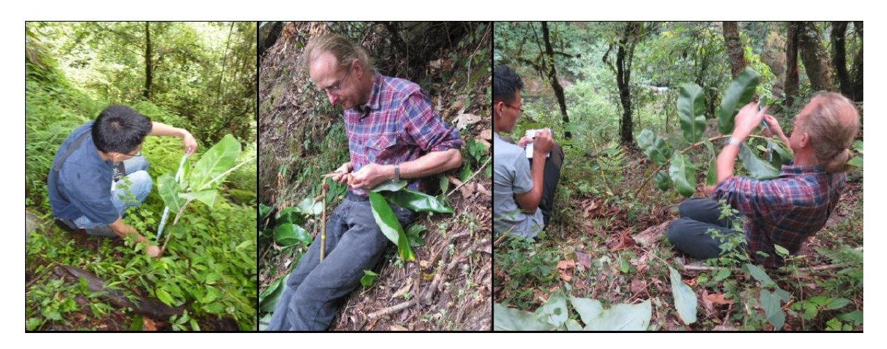
Figure 2. Sampling H. gardnerianum in the native range (from: Djeddour et al. 2014).

It would also be desirable to know whether such a reduction is likely to achieve a desired goal of native plant regeneration. For example, Fowler et al. (2013) noted that for Tradescantia fluminensis Vell., another environmental weed in New Zealand, the threshold biomass above which native forest regeneration fails was 200 g m<sup>-2</sup> (dry weight). The average biomass of T. fluminensis in New Zealand was 455 g m<sup>-2</sup>, indicating that a mean reduction of >255 g m<sup>-2</sup> (i.e. a >56% reduction in biomass) is required to restore native forest regeneration in areas invaded by T. fluminensis . In Brazil, where T. fluminensis is native, the mean biomass was 164 g m<sup>-2</sup>, indicating that if biocontrol could reduce T. fluminensis biomass in New Zealand to levels similar to those recorded in the native range, then this should restore ecosystem function.