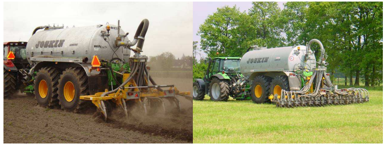
Figure 3. Equipment for injecting slurry into soil and pasture.

However there is a lot of variation among different slurry application methods and considerable work is being undertaken in northern EU countries to determine the best application approaches. This work shows that surface application (trailing shoe) or soil 'injection' are the best approaches to minimise odours and maximise the retention of volatile nutrients Figure 3.