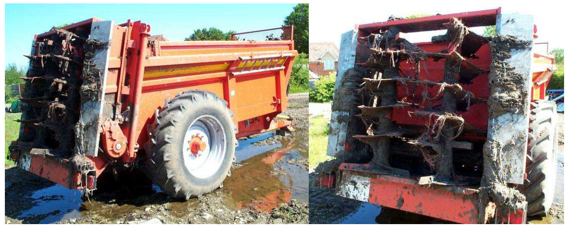
Figure 2. Rear discharge FYM spreader.

However there is a lot of variation among different slurry application methods and considerable work is being undertaken in northern EU countries to determine the best application approaches. This work shows that surface application (trailing shoe) or soil 'injection' are the best approaches to minimise odours and maximise the retention of volatile nutrients Figure 3.