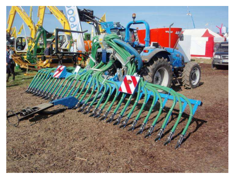
Figure 4. Umbilical system spreader The BHU Future Farming Centre www.bhu.org.nz

Trailing shoe and injection slurry applicators are substantial machines using pressure vessels and are therefore the most expensive means of applying biological / organic fertilisers. Also carrying the considerable amounts of ferment in tanks across fields can cause significant compaction. Umbilical spreading systems may therefore need to be used (Figure 4).