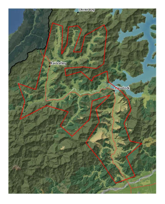
Figure 1: Rai, Pelorus and Kaituna Valley soil map area.

To improve the current soil map information (FSL) of the Rai Pelorus and Kaituna Valleys, including better resolution (~1:20,000-1:50,000 map scale) and improved soil data for S-Map. The work area is shown in Figure 1. The area within the polygon that is "valley floor" (0-10 degrees slope) is 112 km<sup>2</sup> (11,200 ha).