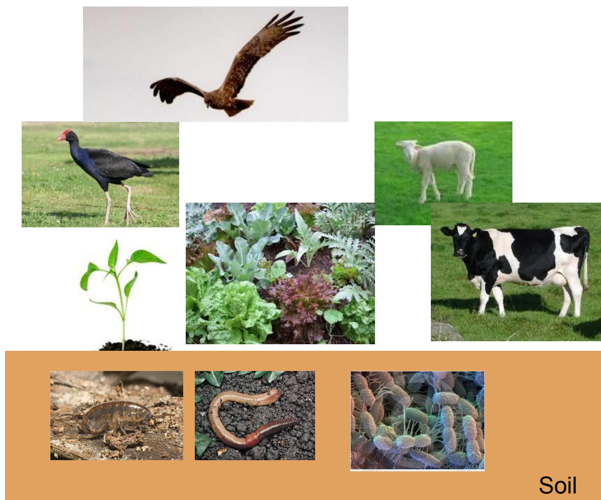
Figure 1 Receptors to be considered in the development of ecological soil guideline values.

Actual values for Eco-SGVs are determined by decisions can be made about the toxicological data used and the level of protection afforded by the Eco-SGVs. These decisions are more a matter of policy and consensus rather than science, and should take into account the intended application of the Eco-SGVs. A series of workshops were held to provide input to the development of the methodology. These workshops were held with