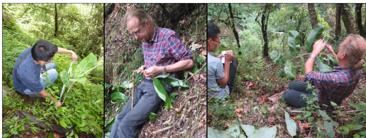
Figure 2. Sampling H. gardnerianum in the native range (from: Djeddour et al. 2014).

It would also be desirable to know whether such a reduction is likely to achieve a desired goal of native plant regeneration. For example, Fowler et al. (2013) noted that for Tradescantia fluminensis Vell., another environmental weed in New Zealand, the threshold biomass above which native forest regeneration fails was 200 \text{ g m}^{-2} (dry weight). The average biomass of T. fluminensis in New Zealand was 455 \text{ g m}^{-2} , indicating that a mean reduction of >255 \text{ g m}^{-2} (i.e. a >56\% reduction in biomass) is required to restore native forest regeneration in areas invaded by T. fluminensis . In Brazil, where T. fluminensis is native, the mean biomass was 164 \text{ g m}^{-2} , indicating that if biocontrol could reduce T. fluminensis biomass in New Zealand to levels similar to those recorded in the native range, then this should restore ecosystem function.