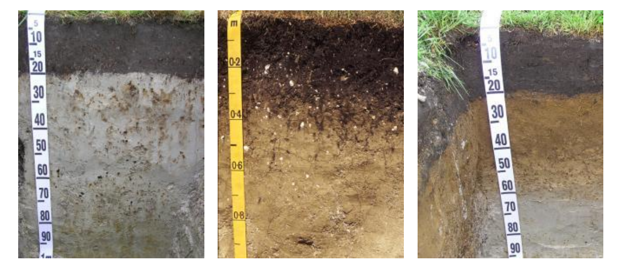
Figure 2. Examples of soil profile photographs, with prepared soil face and tape for scale.

Table 9. Photographs and the information required to be included to support them